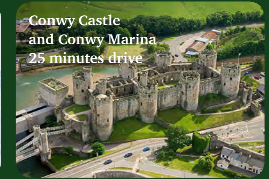
Conwy Castle and Conwy Marina 25 minutes drive