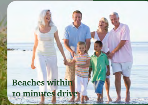
Beaches within 10 minutes drive