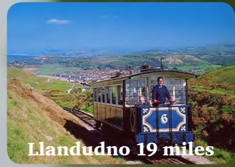
Llandudno 19 miles

Sun Valley is Perfectly located on the banks of the River Clwyd in Rhuddlan and close to beaches and local attractions on the North Wales Coast, the ideal location to explore the sandy beaches, beautiful landscapes and the historic ruins and idyllic villages. From the park over looking the river, you can see Rhuddlan Castle, a magnificent sight which has been standing guard over this region of Wales for more than 700 years.