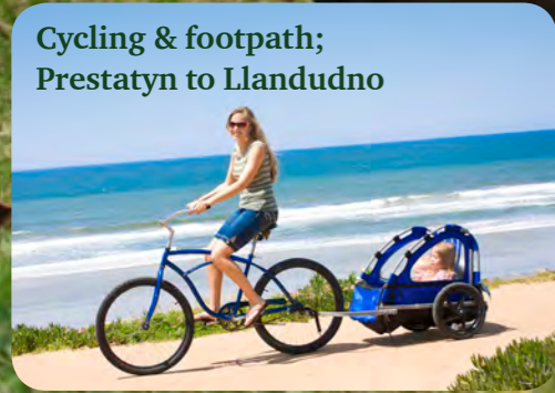
Cycling & footpath; Prestatyn to Llandudno

Enjoy fishing in the adjacent river and Golfing locally. Special Rates for Rhuddlan Golf Course, Enquire at Reception.