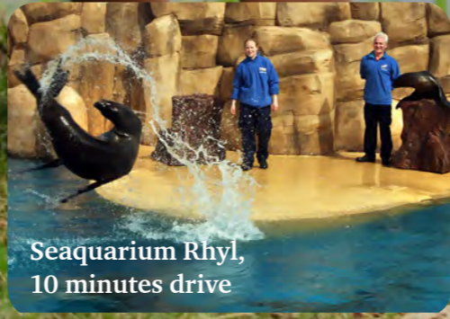
Seaquarium Rhyl, 10 minutes drive

Enjoy fishing in the adjacent river and Golfing locally. Special Rates for Rhuddlan Golf Course, Enquire at Reception.