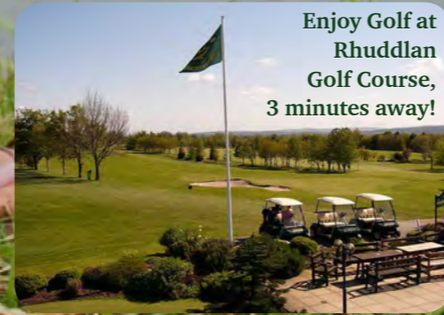
Enjoy Golf at Rhuddlan Golf Course, 3 minutes away!