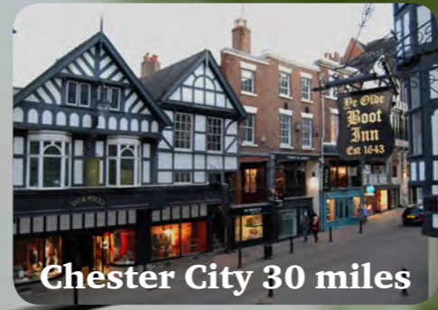
Chester City 30 miles